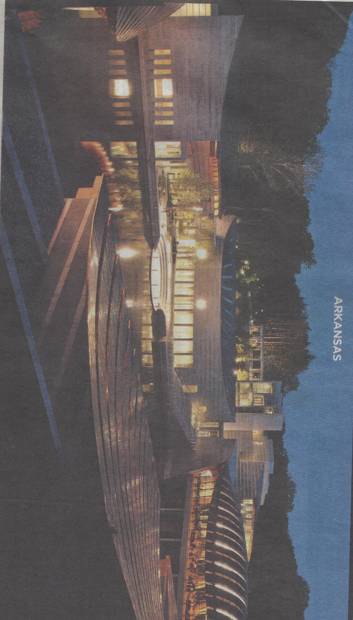
Crystal Bridges Museum of American Art in Bentonville, Ark., was designed by architect Moshe Safdie and houses a collection amassed by Alice Walton.